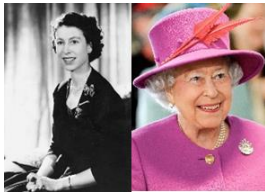
Elizabeth Alexandra Mary Windsor