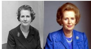
Margaret Hilda Thatcher (née Roberts)

Occupations: Auxiliary Territorial Service, Queen of the United Kingdom and the Commonwealth Realms (from 1952)